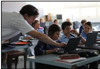
Year Seven students enjoy using their new tablets.