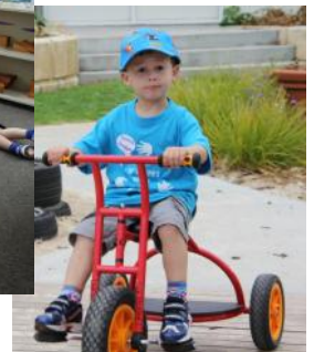
Four Year Old Kindergarten - First Day