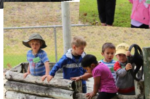
Three Year Old Kindergarten enjoy their first day at School