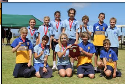
Medallion and Shield Winners for Upper Primary (Years 4-7)