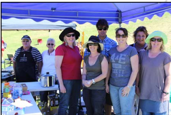
P&F Committee Co-ordinated the Sausage Sizzle for the Senior Inter-school Athletics Carnival last Thursday

To the College Parents, Teachers and Students that help throughout the year at events, assemblies and functions, without you the P&F would not survive. We rely on your support, whether it be - baking a cake, making sandwiches or barbequing some sausages and we so very much appreciate everything that you all do.