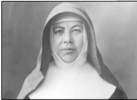
Mary MacKillop in the 1890's

On Sunday 17 October, (for this year only) being the day of the canonisation in Rome, the Feast of Blessed Mary MacKillop will be observed in all dioceses across Australia. Further details will be made available as they come to hand from our bishop.