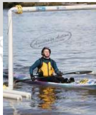
Left: Crossing through the finish line