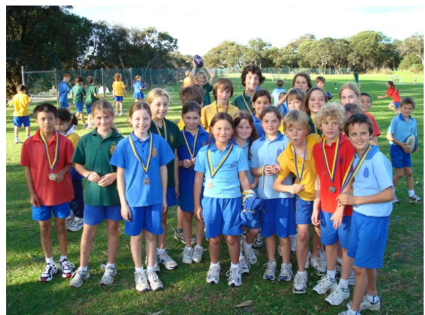
Inter-House Cross Country Medal Winners